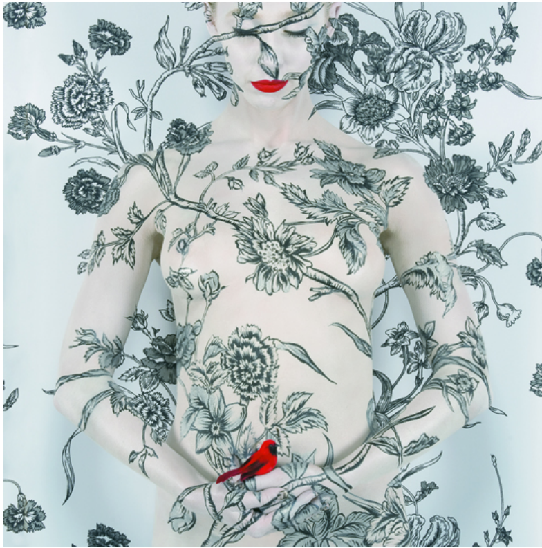
Wallpaper Red Bird - Emma Hack

Emma says she always asks her model what they feel uncomfortable about in relation to their bodies and tries to cover it. 'It's about feeling good, so if something doesn't feel good to the model, it will come out in the shoot.'