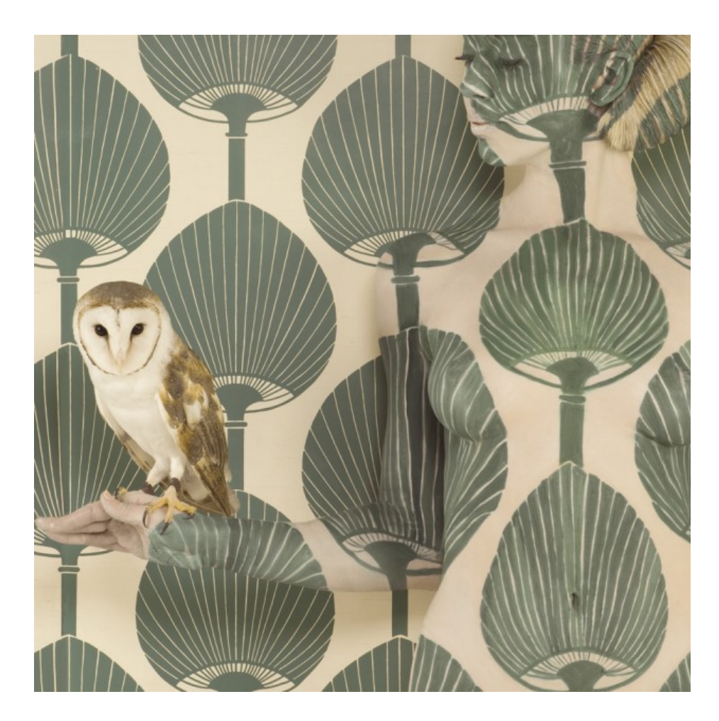
Wallpaper Owl III