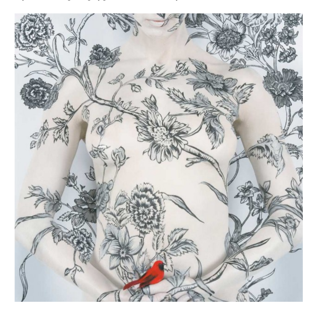
Red Bird III

Creating my first exhibition and calendar – a dream come true that launched my career and promptly put me in debt for 2 years!