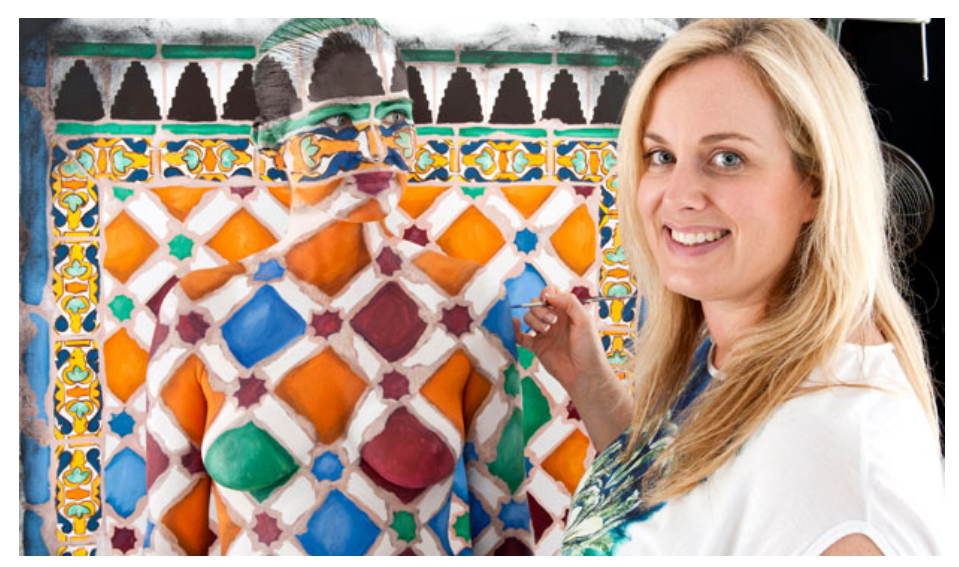
BRUSH TO JUDGEMENTS